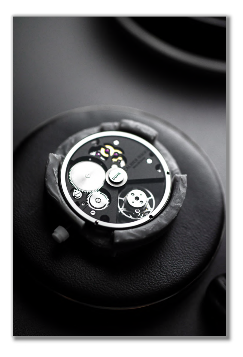
8 pieces limited edition

Carbon fiber titanium cap Titanium grade 5 bezel, case back, horns, crown, middle case