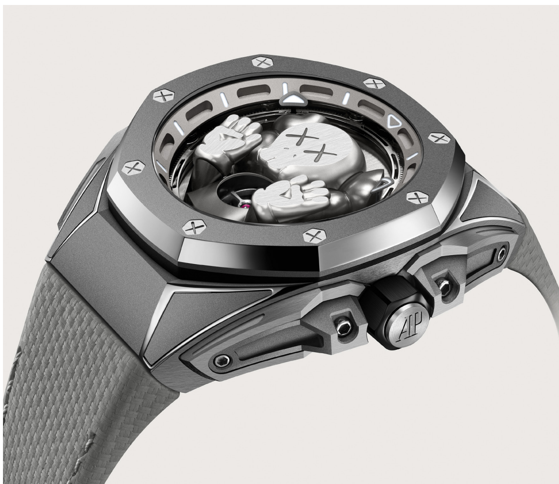
▲ The 43 mm titanium Royal Oak Concept Tourbillon "COMPANION" limited edition reinterprets Haute Horlogerie through the lens of artist KAWS.

who has placed a miniature COMPANION at the very heart of the watch. To give pride of place to this cartoon-like character, the Manufacture has literally put time to the side thanks to the use of an innovative peripheral time display. At once universal and provocative, witty and inquisitive, the collaboration invites the viewer to see Haute Horlogerie in a different light and to reflect on the power of the imaginary to push boundaries.