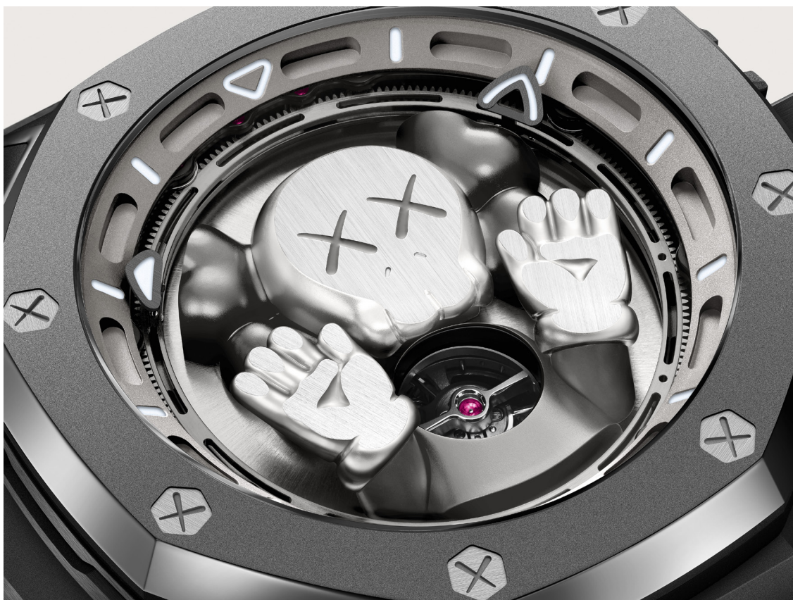
▲ The timepiece features an innovative peripheral time display to give centre stage to KAWS' COMPANION on the dial.

pinions and guided by rollers. The titanium hour and minute hands, both filled with luminescent material that turns blue in the dark, are fixed to their respective peripheral wheel. In addition, the minute hand is openworked to distinguish it from the hour hand and facilitate the reading of time. The five-minute graduations, carved into the titanium inner bezel, also glow blue in dim light.