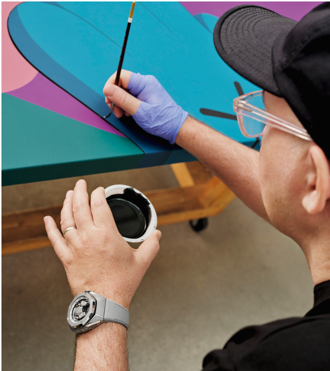
▲ KAWS, who started out as a graffiti artist in the 1990s, is one of the most popular artists working today.

Today, this cultural phenomenon takes on unprecedented miniature proportions to explore the creative territory of fine watchmaking. Placed at the very heart of its eponymous Royal Oak Concept Tourbillon limited edition, this imaginary character both subverts and humanises Haute Horlogerie, pushing the limits of the craft.