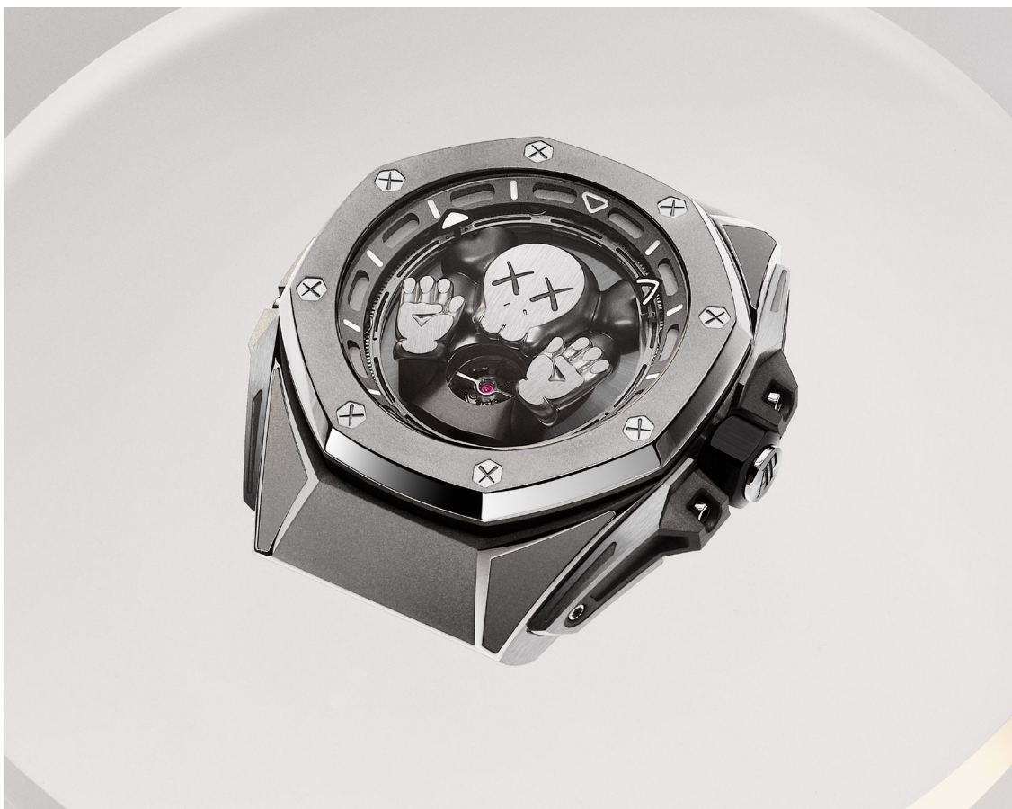
▲ The miniature KAWS' COMPANION takes centre stage on the dial, peering curiously out from under the sapphire crystal.

Lastly, in a nod to KAWS' dissected series, the chest of the COMPANION reveals its beating heart, the watch's tourbillon, blurring the line between the character and the movement.