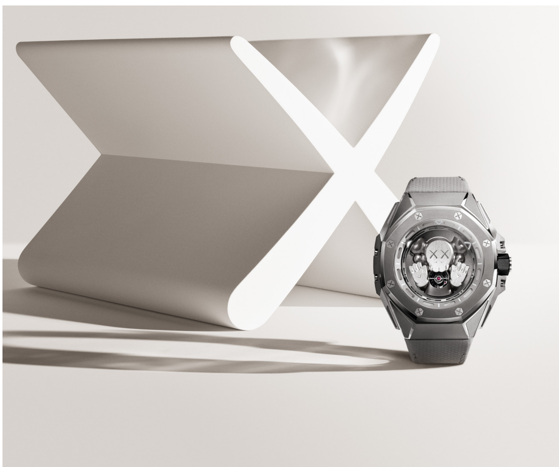
▲ The 43 mm multifaceted titanium case plays with light and texture, while the dark grey calfskin leather strap enhances the watch's contrasting grey tones.

KAWS' signature and the words "Limited Edition of 250 pieces." The black ceramic crown, topped with a titanium chip, adds the final touch. The play of textures and light continues on the dark grey calfskin leather strap. The interchangeable system integrated directly into the case and the triple-blade folding clasp allows the wearer to change styles with a quick click and release. The watch comes with a second strap in slate grey calfskin leather, also decorated with a textile pattern, to enhance its contrasting grey tones.