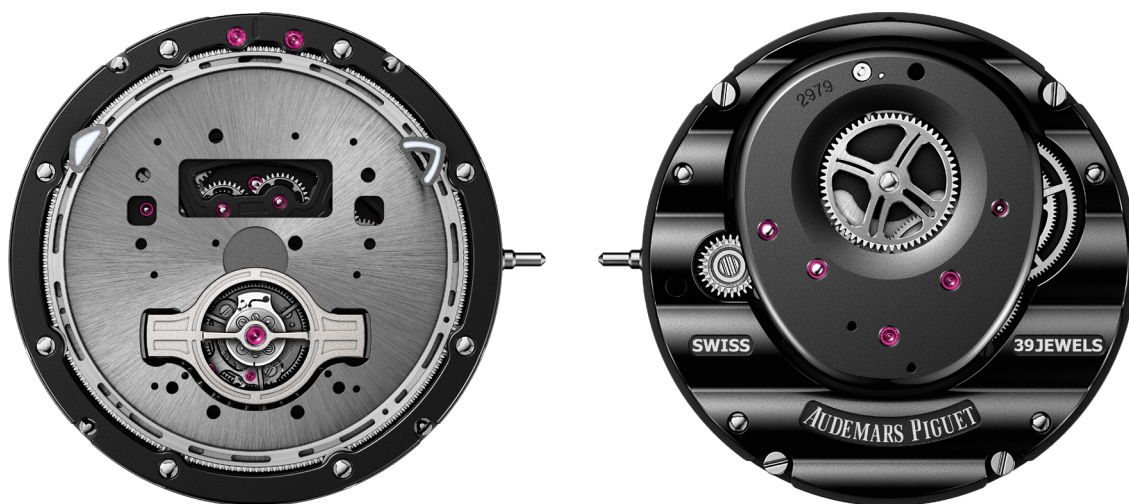
▲ Front and back views of Calibre 2979.

bridges, whose padded aesthetic is inspired by KAWS' cast of characters. The gear train bridge opens onto the ratchet wheel, which arms the barrel-arbour when the watch is wound, and which has been crossed out to reproduce KAWS' emblematic X. The click that prevents it from turning in the unwinding direction is also visible at 12 o'clock. The bridges' blackened aesthetic is contrasted by the mention of "Swiss," "39 jewels" and the "Audemars Piguet" signature, all engraved by laser and filled with white lacquer.